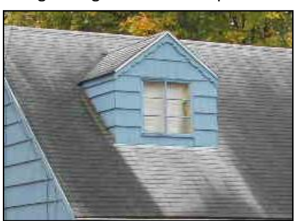
Extensive algae growth

Algae require moisture and proper temperatures to grow. Dew is the primary moisture source. Algae are found predominantly in the Southeast, but it can and will grow nationwide. The algae generally grow on the northern exposures of the roof since this exposure generally receives less sunlight. Algae are well adapted to extreme conditions.